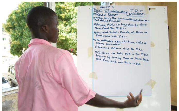
A participant presents the suggestions one of the children's working groups made