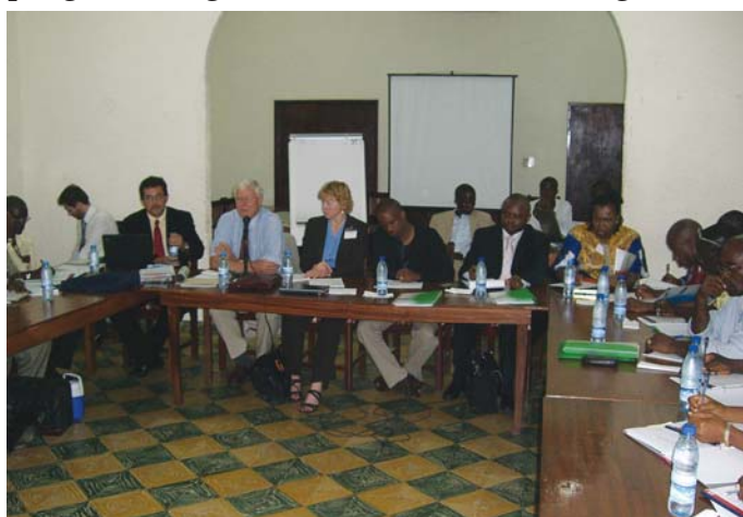
ICTJ facilitators and participants at the workshop, February 6, 2007